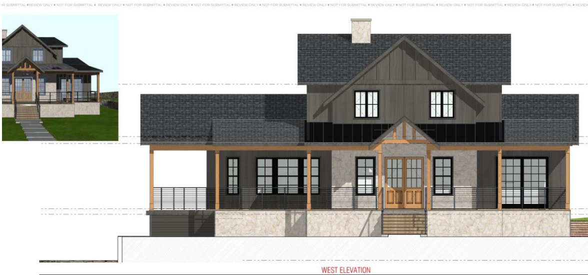
Figure 3: Front/West Elevation

The rear (east) elevation consists of the vertical board and batten siding, a simple window pattern, and gabled roof forms. The elevation is minimally ornamented and continues the same siding and roof materials used on the other elevations.