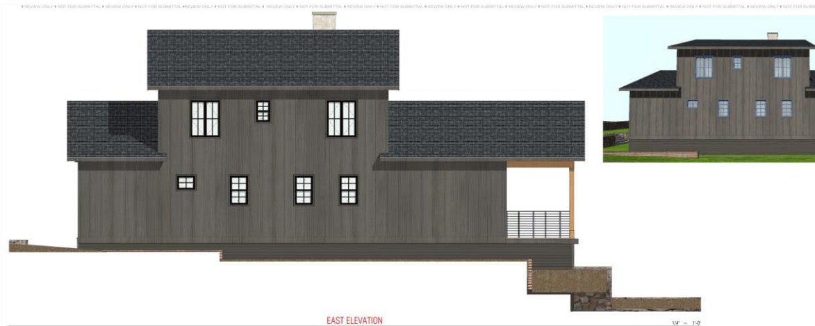
Figure 4: Rear/East Elevation

The rear (east) elevation consists of the vertical board and batten siding, a simple window pattern, and gabled roof forms. The elevation is minimally ornamented and continues the same siding and roof materials used on the other elevations.