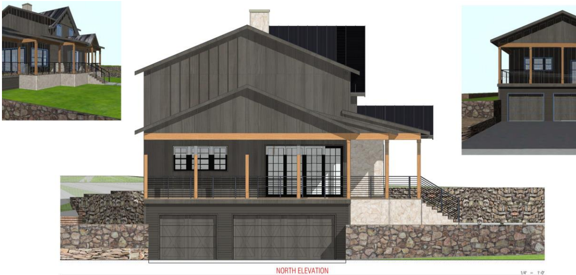
Figure 5: Side/North Elevation

The south elevation consists of a gabled residential form with vertically oriented windows, vertical board and batten siding, and the continuation of the porch and deck elements. The materials and detailing are consistent with the rest of the proposed residence.