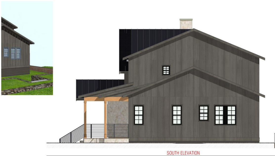
Figure 6: Side/South Elevation

The south elevation consists of a gabled residential form with vertically oriented windows, vertical board and batten siding, and the continuation of the porch and deck elements. The materials and detailing are consistent with the rest of the proposed residence.