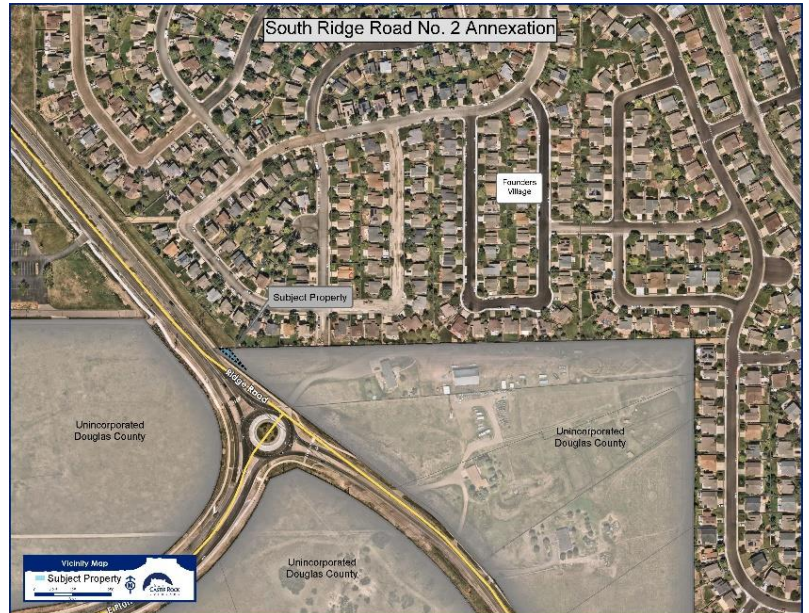
Figure 3: South Ridge Road No. 2 Annexation Vicinity Map

The South Ridge Road No. 2 Annexation consists of one parcel located approximately 220 feet north of the South Ridge Road and East Plum Creek Parkway roundabout, on the east side of South Ridge Road (Figure 3 and Attachment A). The parcel is 0.022 acres and abuts Town of Castle Rock Ridge Road ROW. The parcel is undeveloped and is zoned Rural Residential. The land to the east and west of the parcel is zoned Rural Residential in Douglas County. To the north the parcel is adjacent to an open space tract within Founders Village Amended PD, owned by the Founders Villages Master Association HOA.