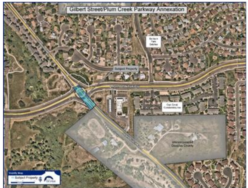
Figure 4: Gilbert Street/Plum Creek Parkway Annexation Vicinity Map

The Gilbert Street/Plum Creek Parkway Annexation consists of one parcel located at the intersection of Gilbert Street/South Lake Gulch Road and Plum Creek Parkway (Figure 4 and Attachment A). The parcel is 0.48 acres and is within the Town of Castle Rock ROW. A roundabout is located within this parcel, which is zoned RR in unincorporated Douglas County, but is abuts the Town of Castle Rock boundaries to the east and west. The properties to the southeast and northeast are within the Young American PD and zoned Commercial. To the northwest and southwest is the Stanbro PD, zoned for Neighborhood Commercial uses, such as personal services, retail, office and restaurants.