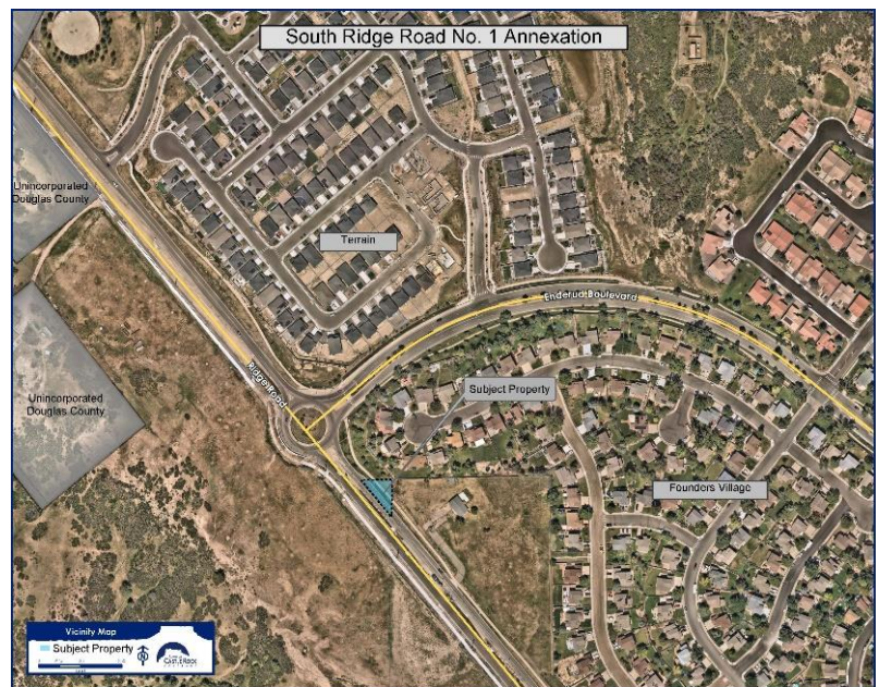
Figure 2: South Ridge Road No. 1 Annexation Vicinity Map