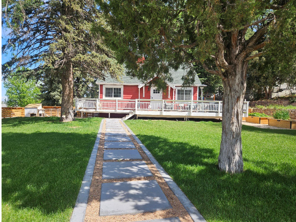
View of front yard and concrete pathway to south elevation of residence, view north (Roll 26-450, image 103150; Emily Wren; 5/22/2026)