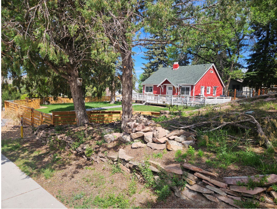
View of the property from the east adjacent parcel, view northwest (Roll 26-450, image 102945; Emily Wren; 5/22/2026)