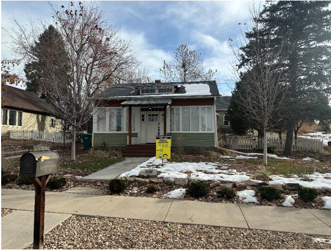
Figure 3: Front/West Elevation

Platted as part of the Craig & Gould's Addition to Castle Rock subdivision, the property includes lot 4 and the northern half of lot 5 in block 16. The bungalow/craftsman house is approximately 1,300 square feet and is only one story. The frame house includes clapboard siding, side gabled roof with dormer window, and an enclosed front entry/porch. A 567 square foot addition, approved by the Historic Preservation Board in 2024, of matching materials off the side elevation of the house is currently under construction on the south side of the house. A detached garage with an accessory dwelling unit (ADU) is located at the rear of the property. Approved by the Historic Preservation Board in 2019, the two-car garage measures approximately 725 square feet and the accessory dwelling unit measures approximately 662 square feet. The structure's skin consists of wood, lap siding and cedar shake singles matching the existing house.