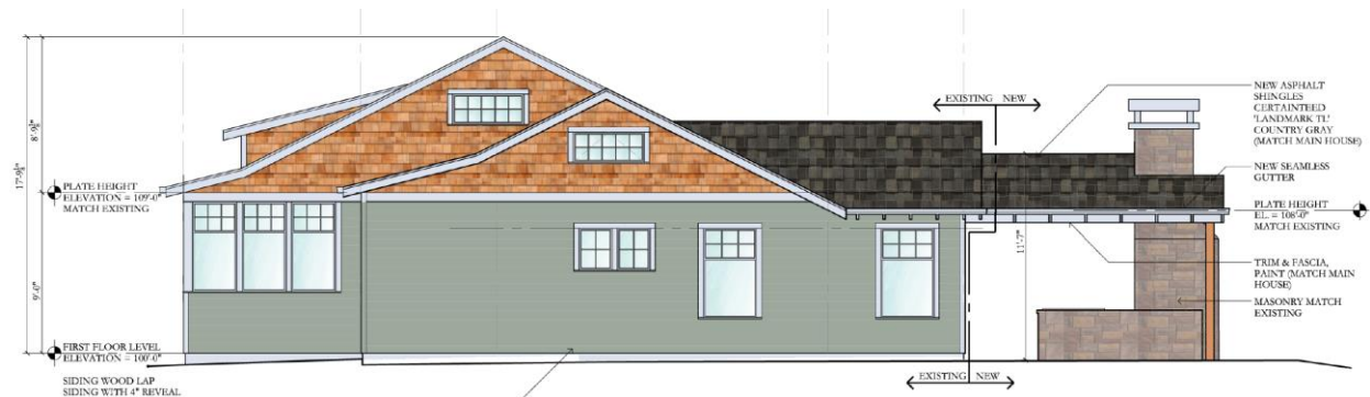
Figure 4: Proposed Side/South Elevation