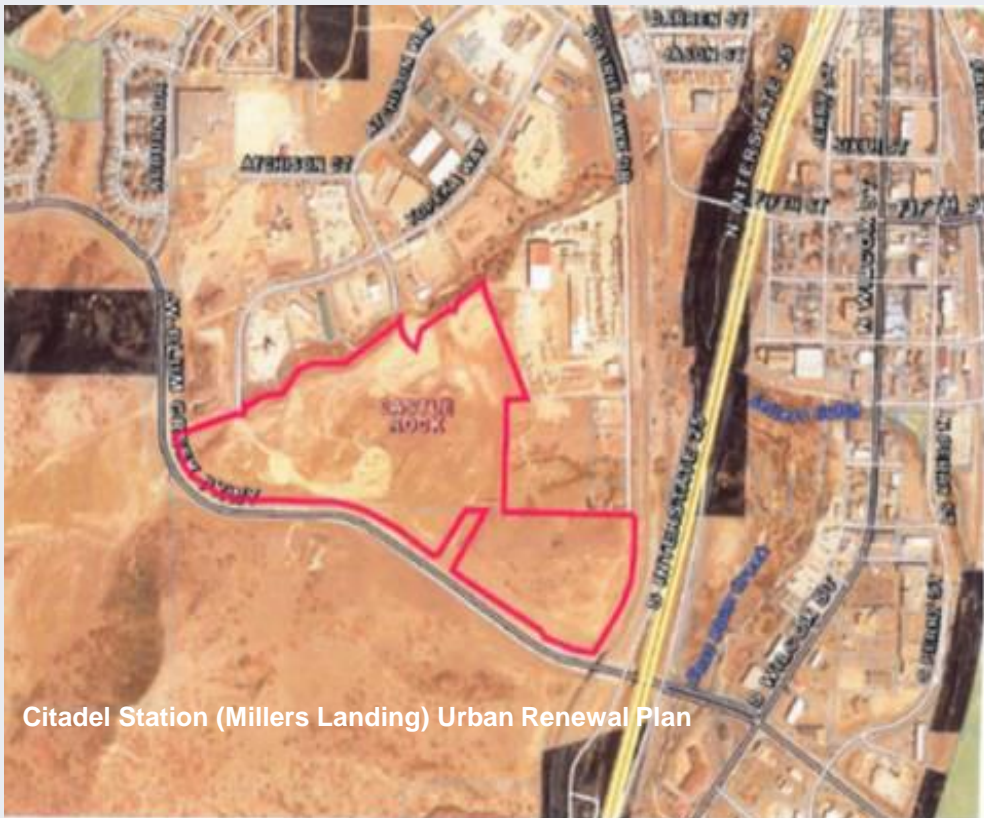
Citadel Station (Millers Landing) Urban Renewal Plan