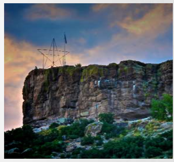
For more information, please visit: CRgov.com/finance