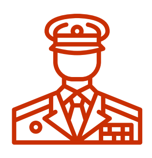
1 emergency manager and 1 office assistant