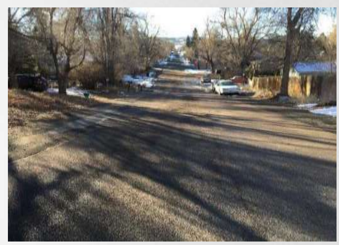
Cantril Street looking south towards Fifth Street