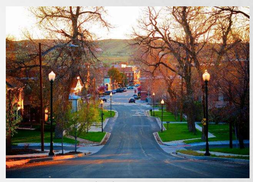
2007 Completed Project Improvements: Third Street looking west toward Downtown