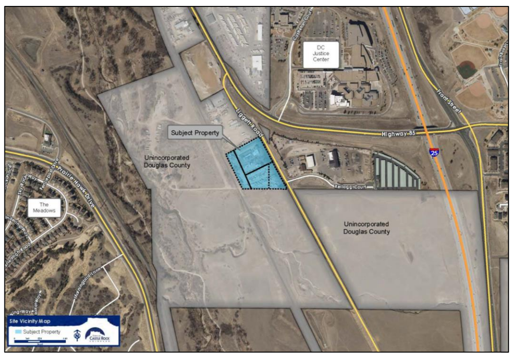
Figure 1: Vicinity Map

Kim Barrett, KGCB Industries, owner, has submitted a petition for annexation to the Town along with an application to be zoned General Industrial (I-2). The property consists of four parcels, totaling 5.34 acres, located on Liggett Road south of the State Highway 85 and Liggett Road intersection (Figure 1 and Attachment A). The William Warren Group is under contract to