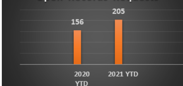
Open Records Requests