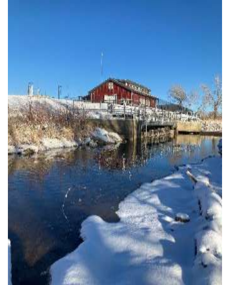
Plum Creek Diversion and Pump Station