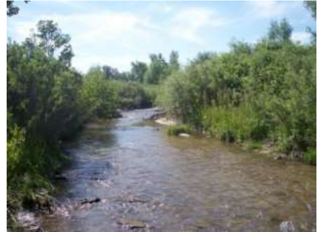
East Plum Creek near PCWPF