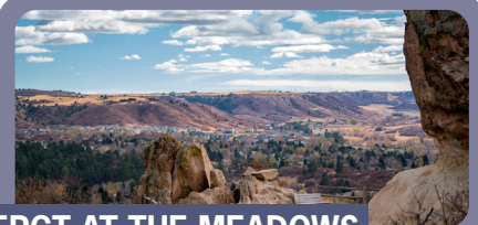
EPCT AT THE MEADOWS