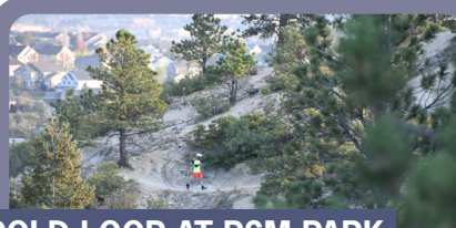
GOLD LOOP AT PSM PARK