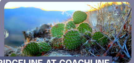
RIDGELINE AT COACHLINE