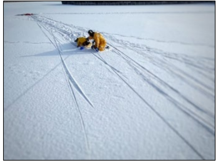
Ice rescue training scenarios