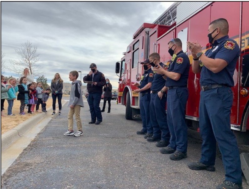
more pictures of contest winners