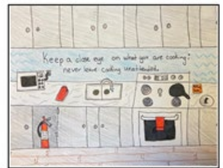
Drawn by Sienna Madrioli, Clear Sky Elementary, 6th Grade 2020 CASTLE ROCK FIRE AND RESCUE DEPARTMENT FIRE/SAFETY POSTER CONTEST WINNER Sponsored by CASTLE ROCK, COLORADO