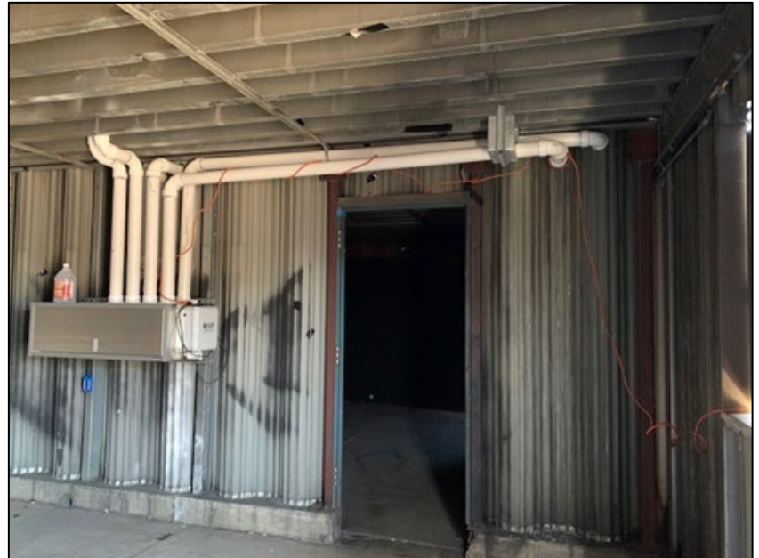
Smoke distributions system at the fire training center