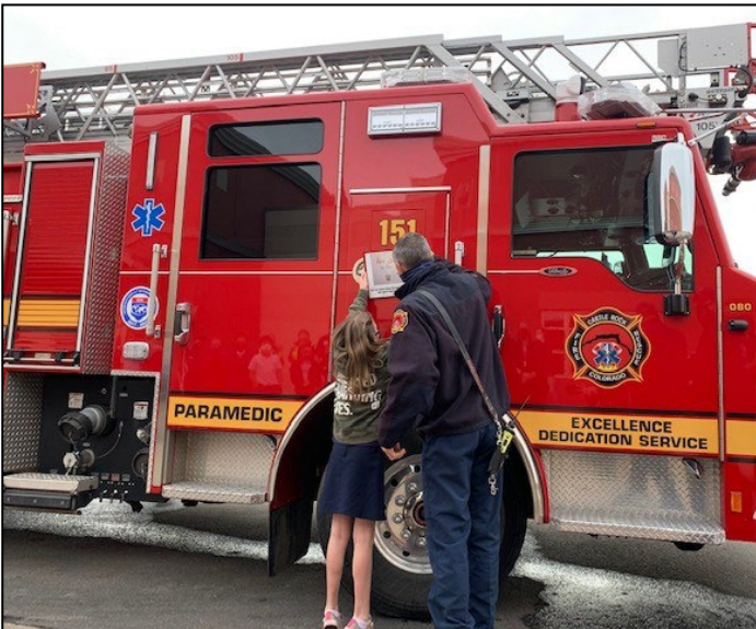
A couple of the winners placing their artwork on the Quints

The virtual car seat program has continued into 2021 as an option for parents/guardians with car seat questions and installs. With varying COVID restrictions still in place, the preference is to do virtual car seat installs. However, there are still citizens bringing their vehicles to the stations to have car seats checked and installed in person. It is not CRFD policy to turn people away. When citizens come in person to a station for a car seat check/install, it is done with the least amount of exposure for our team members and citizens as well. Crews and administrative staff completed a total of 12 rear facing seats and 2 forward facing seat checks/installs this month.