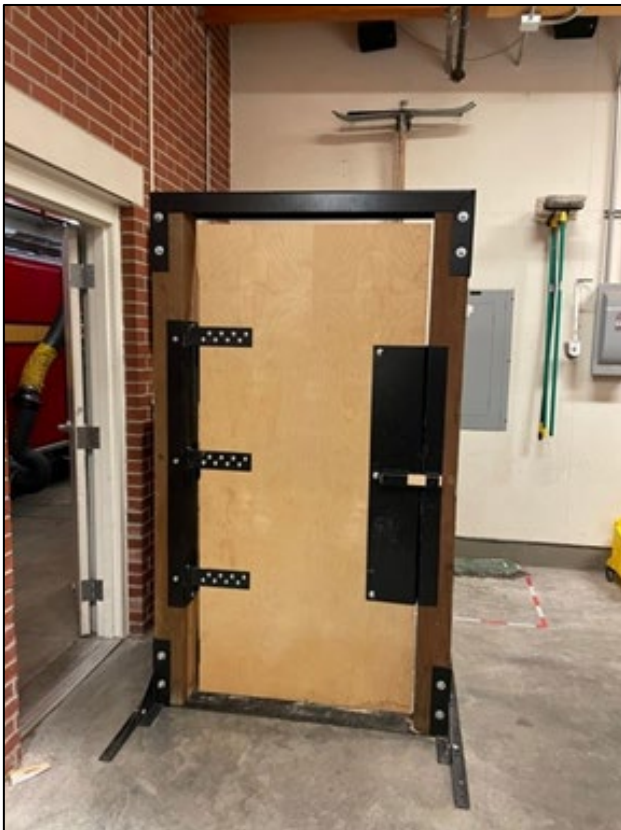
Forcible entry prop at Station 155