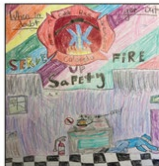
Drawn by Makayla Mooney, Clear Sky Elementary, 5th Grade 2020 CASTLE ROCK FIRE AND RESCUE DEPARTMENT FIRE/SAFETY POSTER CONTEST WINNER Sponsored by CASTLE ROCK, COLORADO