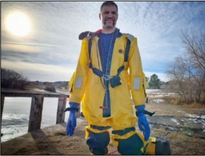
The go-go gadget arms of the ice rescue suits