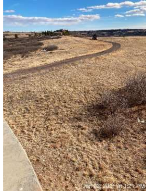
Looking along drain alignment from discharge location.