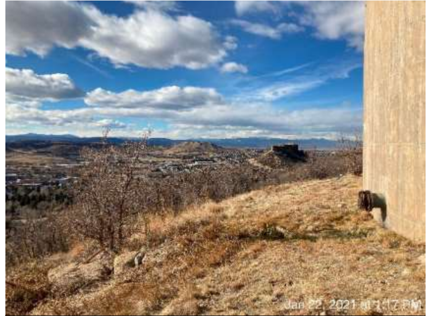
Tank 3 Discharge