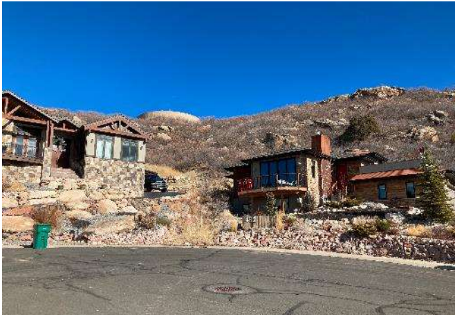
Tacker Court, down hill from Tank 3