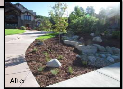
ColoradoScape Renovation (Timber Canyon)