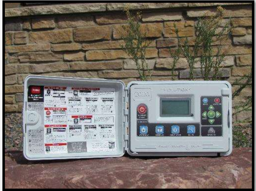
Smart Irrigation Controller