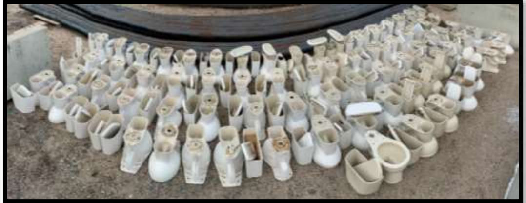
The "Throne Zone"