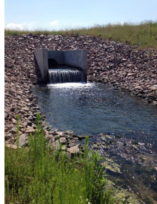
Rueter-Hess inlet structure carrying water from Cherry Creek