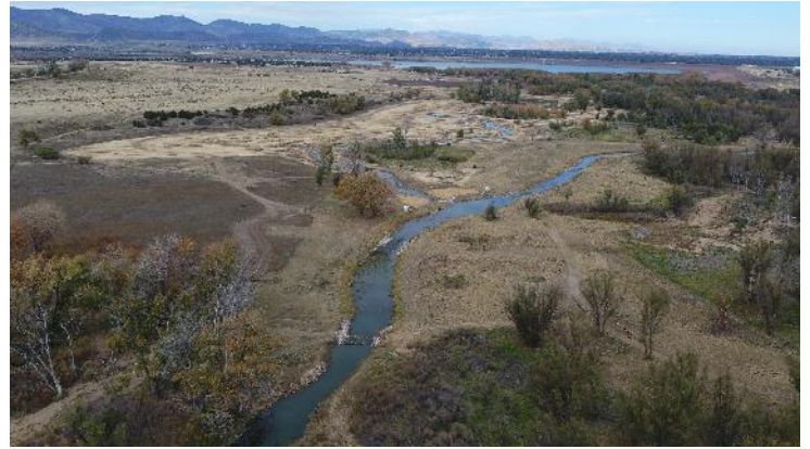
Lower Plum Creek just upstream of Chatfield Reservoir