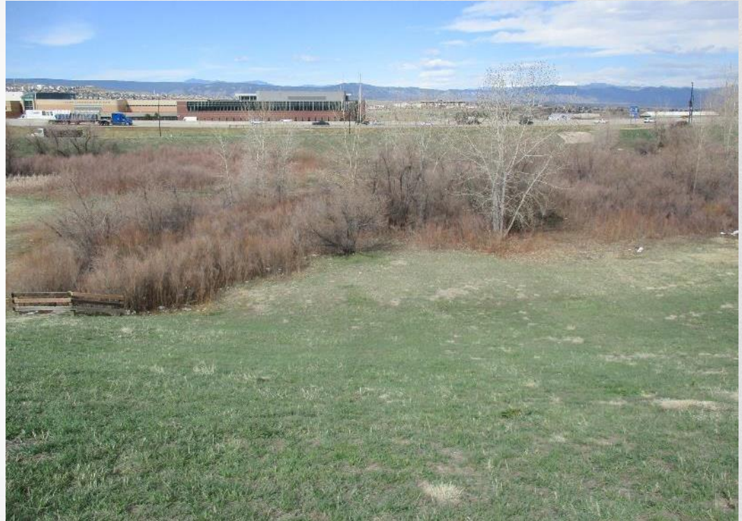
Metzler Ranch Pond