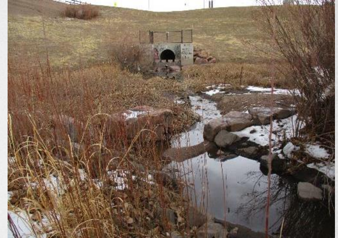
Storm outfall entering pond