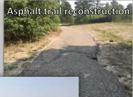
Asphalt trail reconstruction