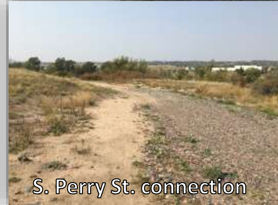
S. Perry St. connection