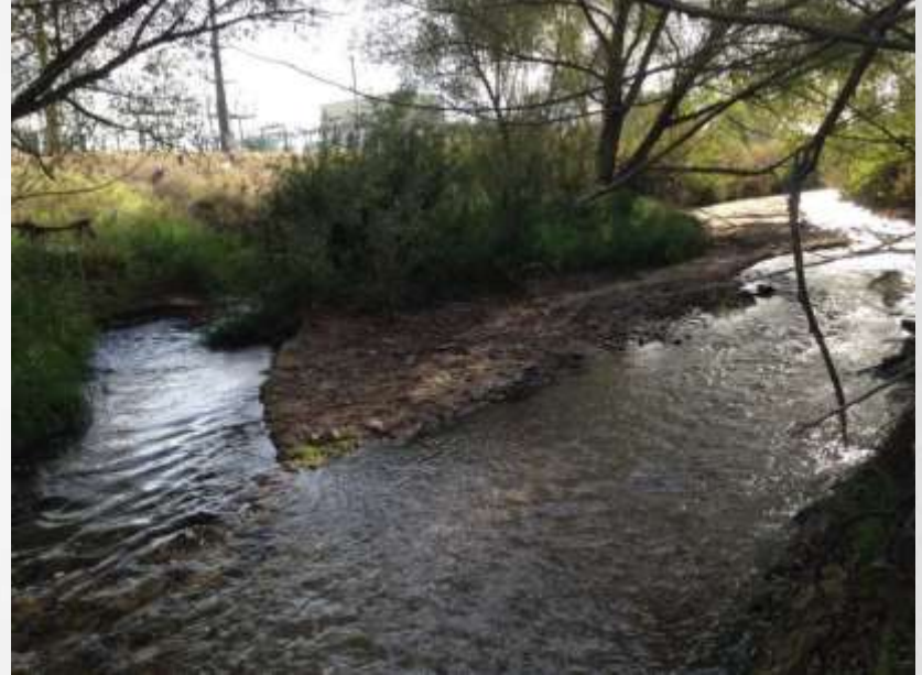
Town's reusable effluent water entering East Plum Creek