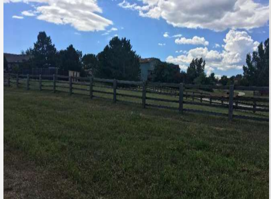
Well CR-231 Site