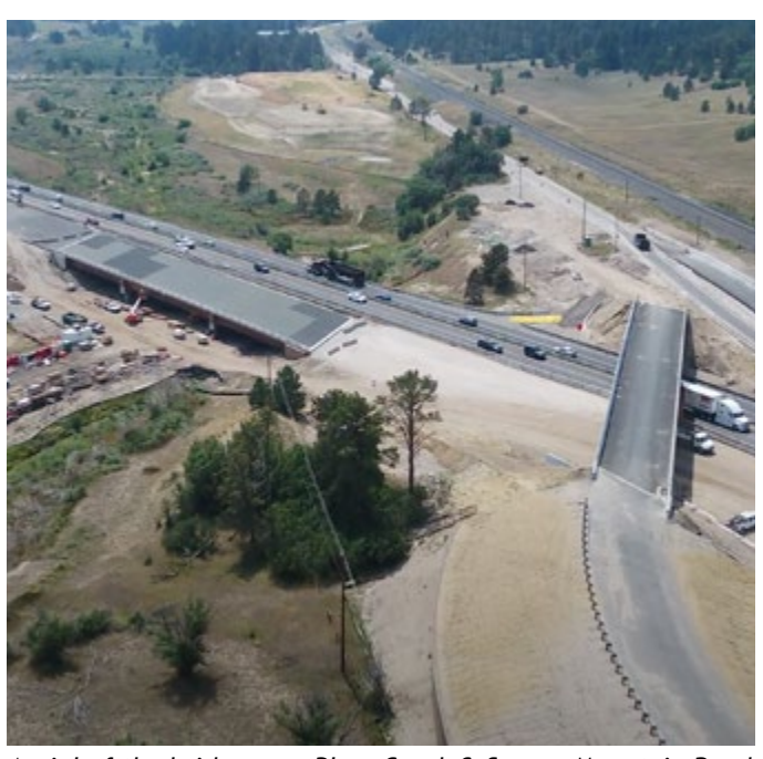
Aerial of the bridge over Plum Creek & Spruce Mountain Road

Thursday, Sept. 17 from 6:30 to 7:30 p.m. Join the project team for an open discussion related to construction progress and safety along the I-25 South Gap corridor. An automated system will call residents throughout the corridor at random to participate. Those who don't receive calls but wish to join can call toll free, 855-710-6230.