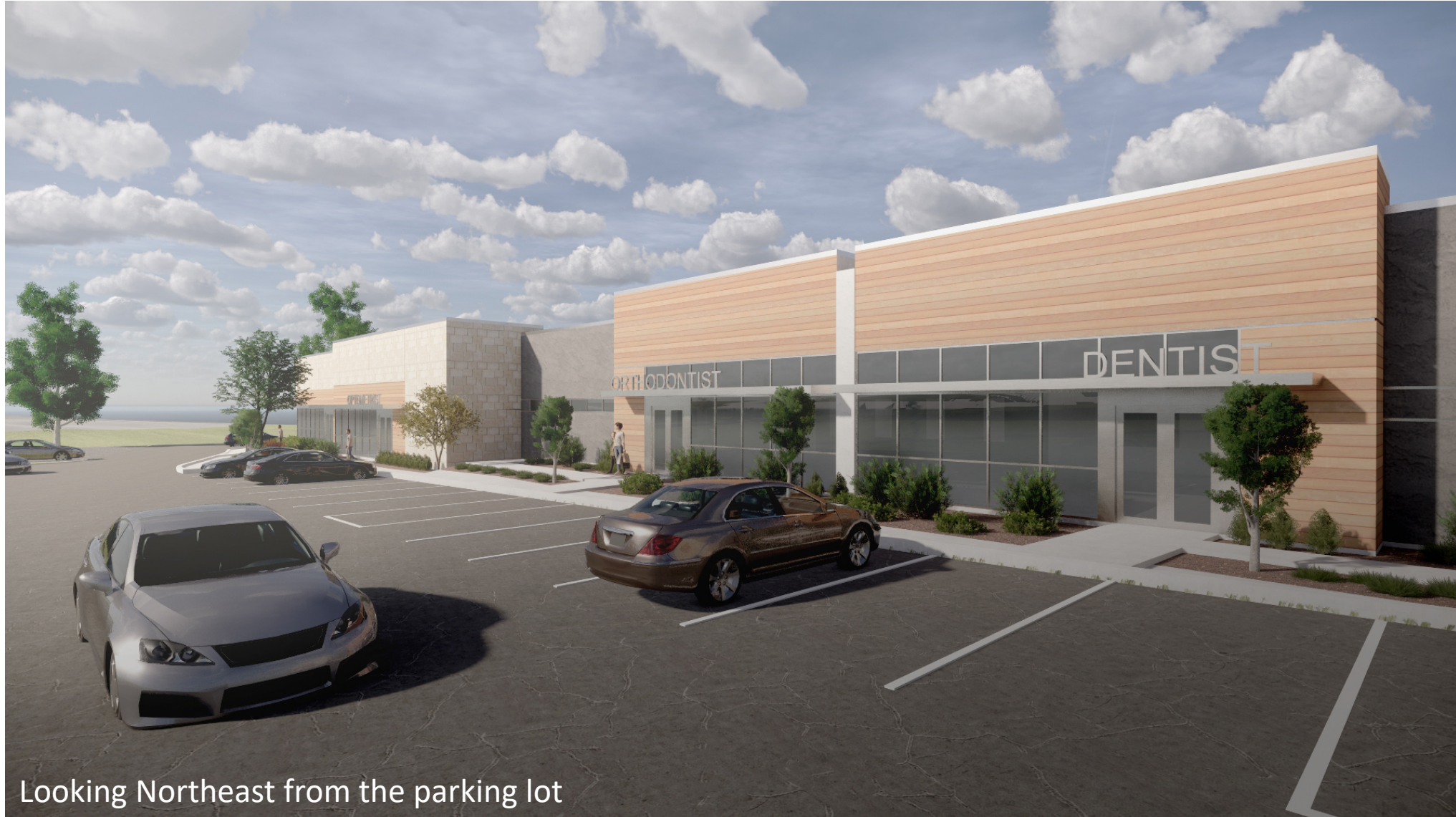
Looking Northeast from the parking lot