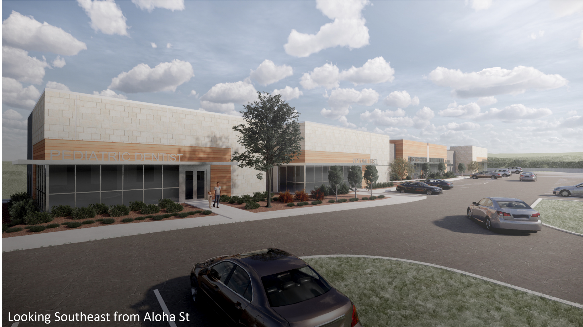
Looking Southeast from Aloha St