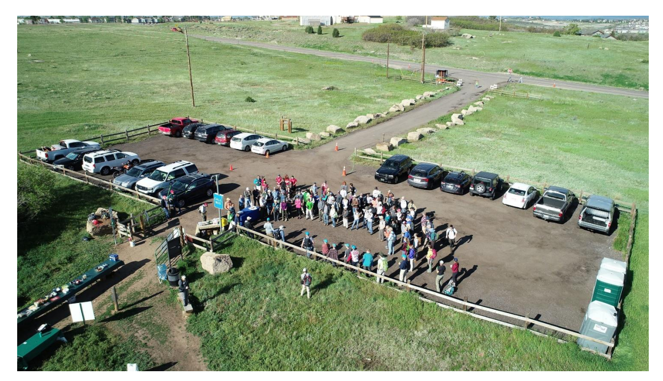
Figure 4: Trailhead and Parking Lot