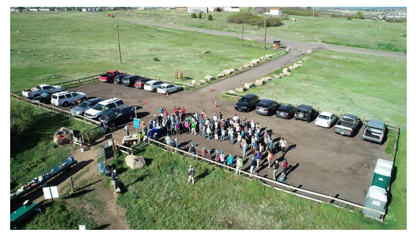
Figure 4: Trailhead and Parking Lot