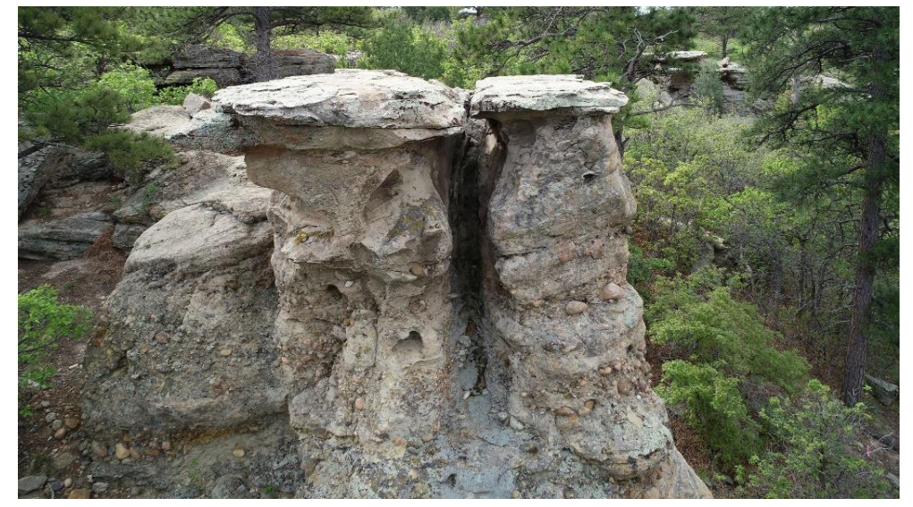
Figure 3: Unique Landforms

Due to the natural, scenic and open space condition of the property, a perpetual Conservation Easement (Easement) was established on the property in 1999. The Conservation Easement restricts the use of the property to public recreation, environmental education, and wildlife conservation. The Easement further prohibits timber