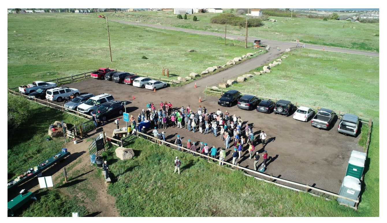
Figure 4: Trailhead and Parking Lot