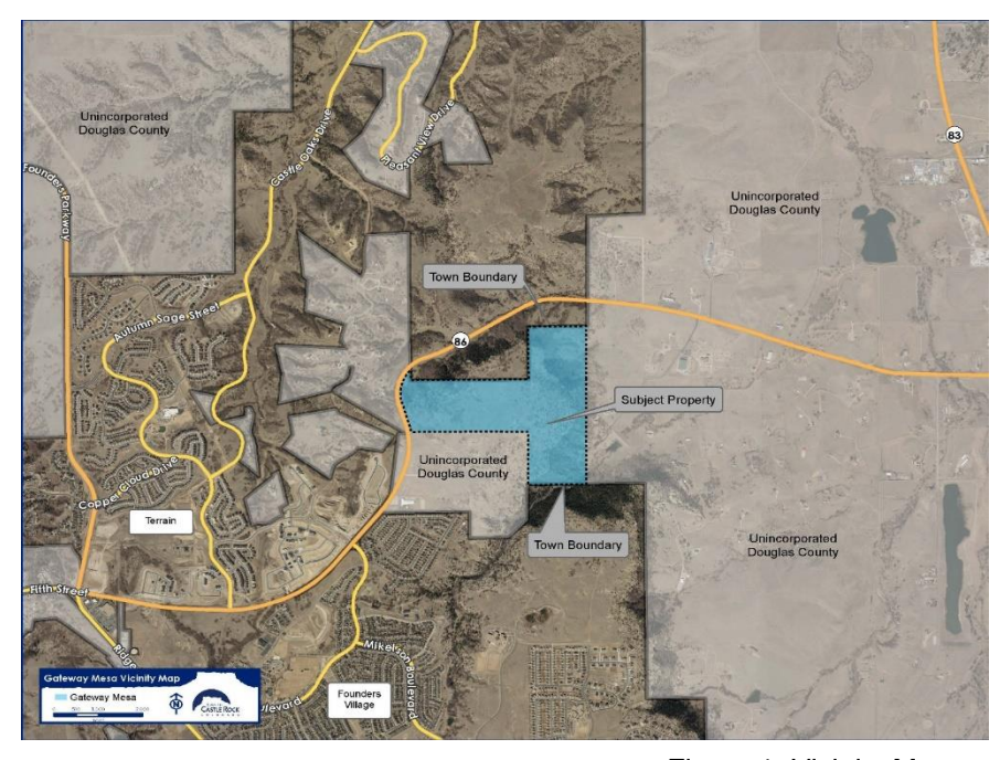
Figure 1: Vicinity Map

The Town of Castle Rock (Town), property owner and applicant, has submitted an application proposing to annex and zone a 199-acre property, currently known to the public as Gateway Mesa