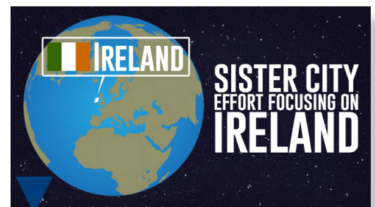
Sister cities effort social media graphic