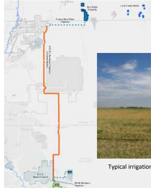
General Location Map