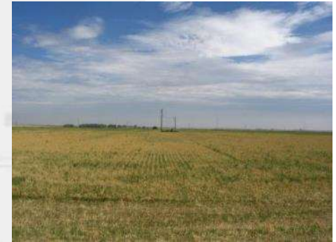
Typical irrigation well in the Lost Creek Basin