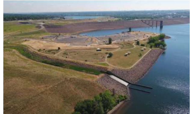
North Boat Ramp area at Chatfield Reservoir