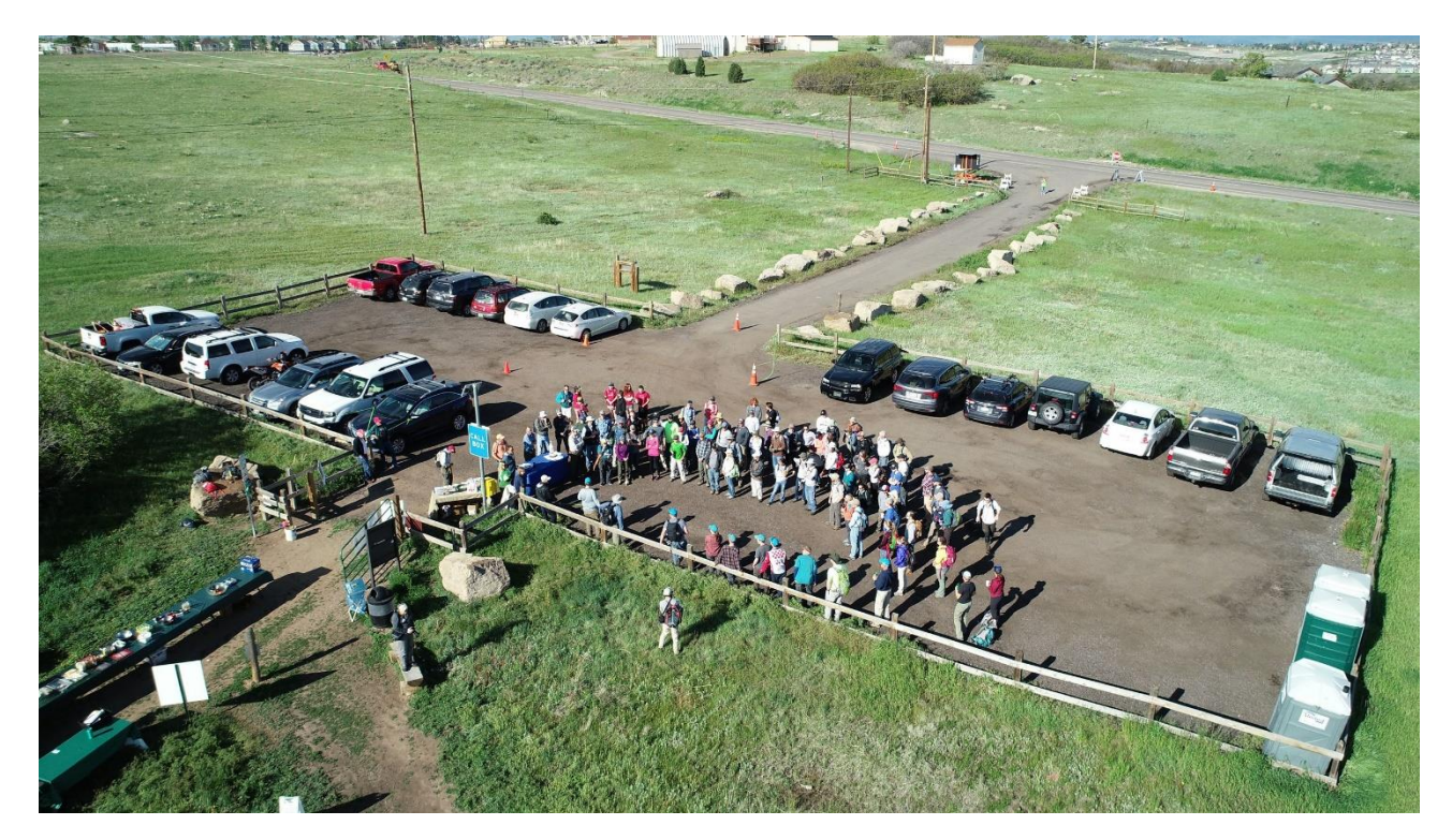
Figure 4: Trailhead and Parking Lot