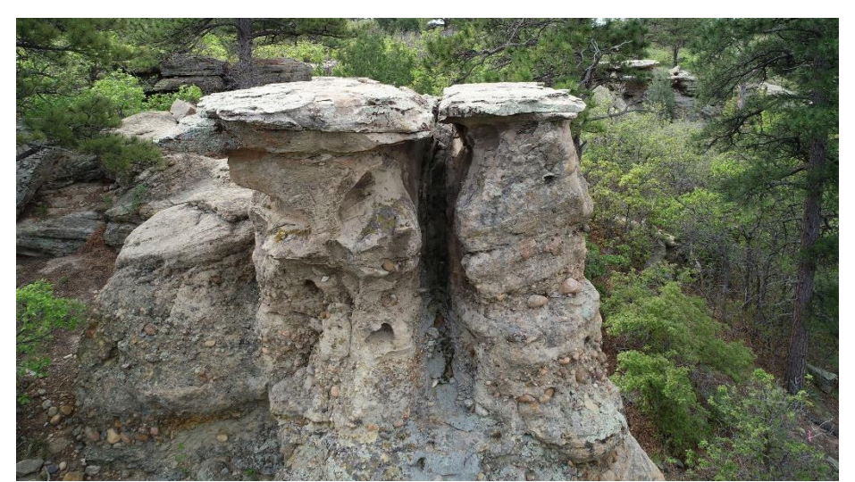
Figure 3: Unique Landforms

and wild turkey are among the wildlife species found on the property. Landforms include cap rock outcroppings and steep cliffs facing the Cherry Creek Valley to the east. To the