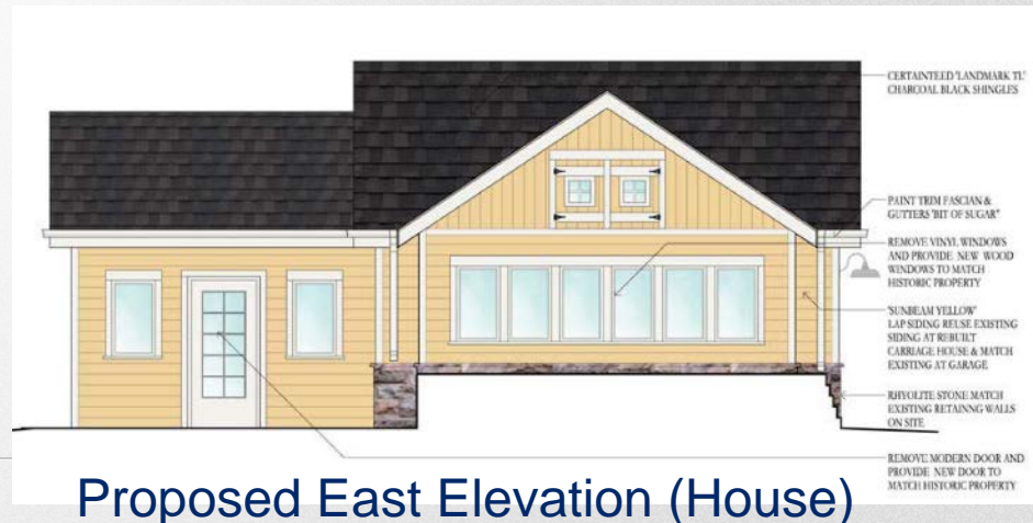
Proposed East Elevation (House)