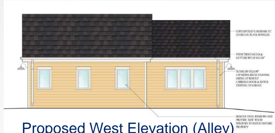
Proposed West Elevation (Alley)