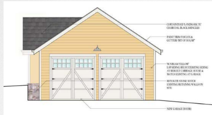
Proposed North Elevation (2 nd Street)