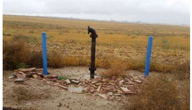
Typical Air Release Assembly along the Keenesburg Pipeline