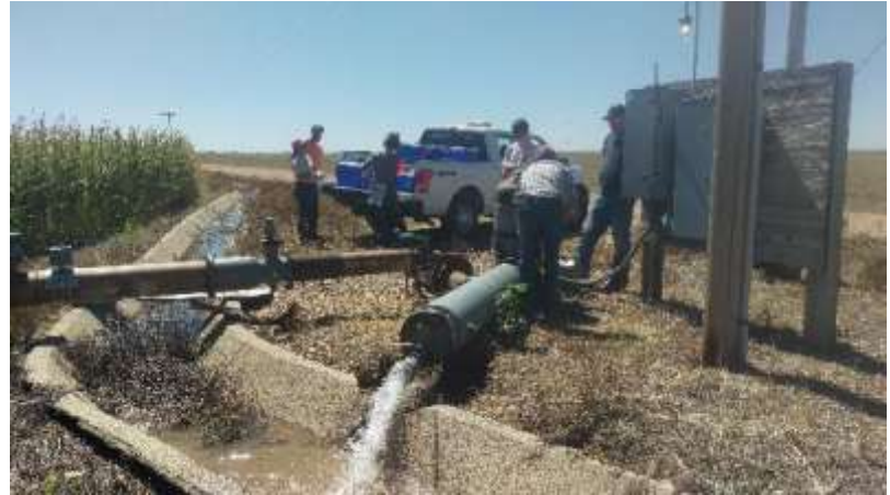
Castle Rock Water Staff obtaining water quality samples from a Lost Creek well