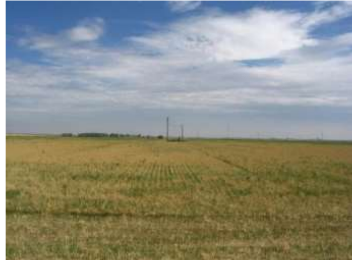
Typical irrigation well in the Lost Creek Basin