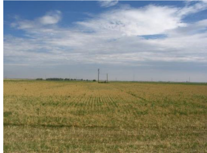
Typical irrigation well in the Lost Creek Basin