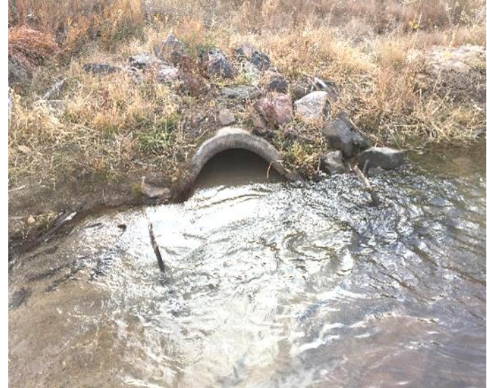
Bell Mountain Outfall entering East Plum Creek