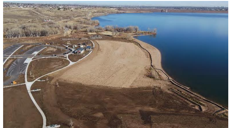
Reconstructed swim beach area