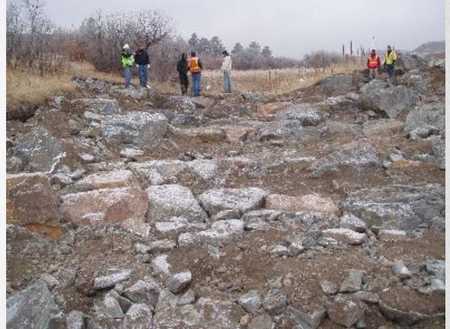
Boulder Cascade Structure on McMurdo Gulch in 2011