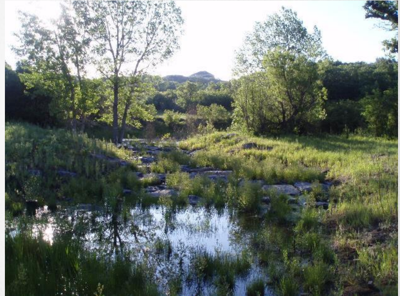
Completed drop structure on McMurdo Gulch