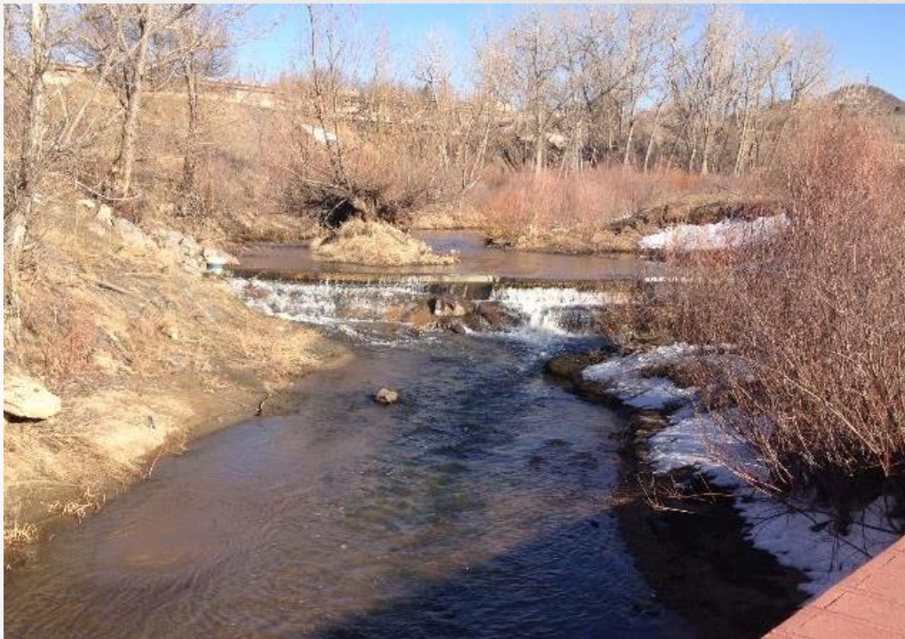
Grade Control needed at CR-1 Diversion