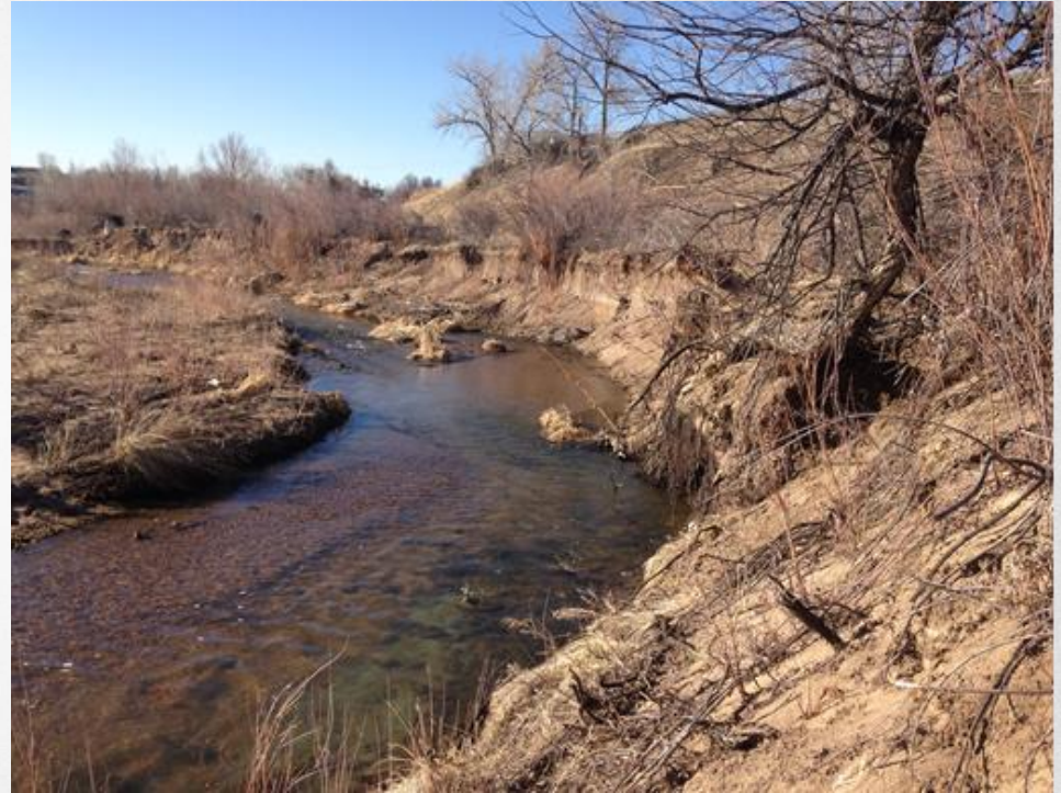
Bank Erosion threatens Sewer Interceptor