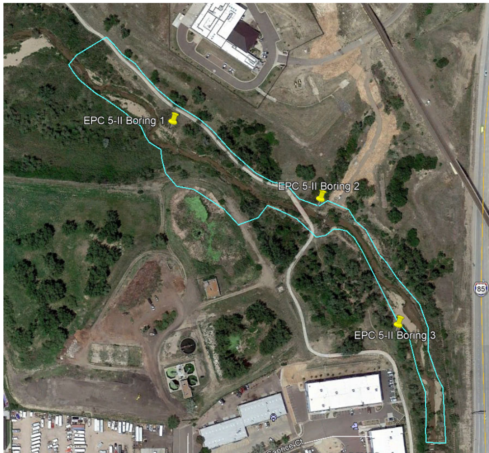
Figure 1. Suggested survey limits (in cyan)

portion of the reach might not need any grade control. It may be possible to reduce the extent of the survey in the upstream, southern to simply determine the longitudinal slope of the channel. If grade control is warranted, additional survey can be performed. The area in cyan is included in the scope. Utility investigation will be completed as part of the SUE.