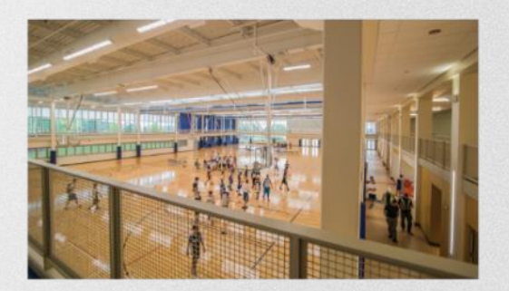
From Athletic Business's award-winning Facilities of Merit