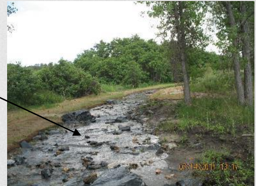
Example riffle structure