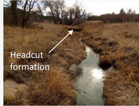
Channel headcut along project reach