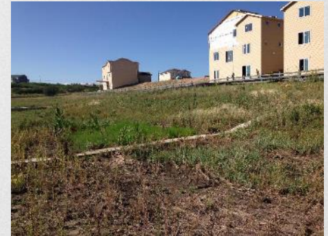
Concrete cutoff walls installed by Terrain