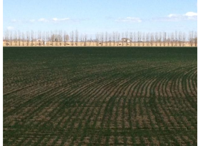
Upland Farmed Area on Box Elder Property