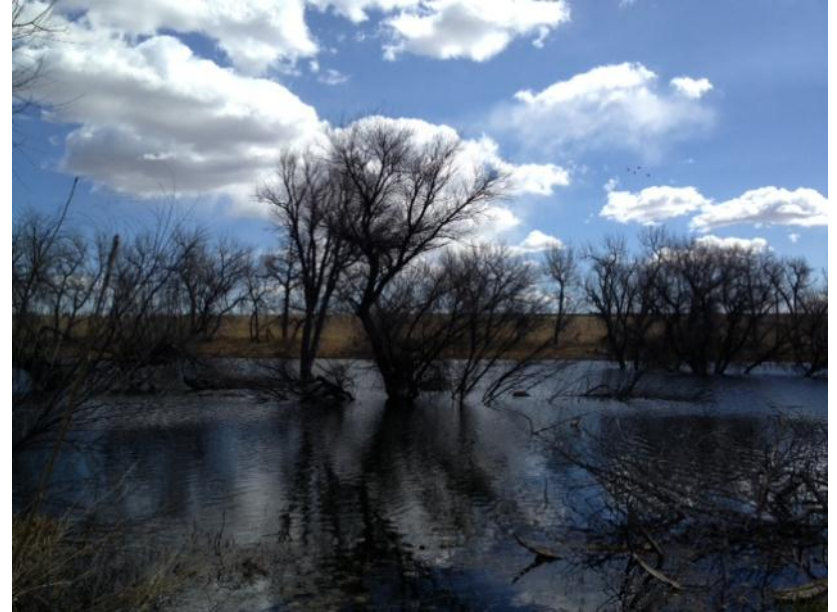
Lowland Flooded Area on Box Elder Property