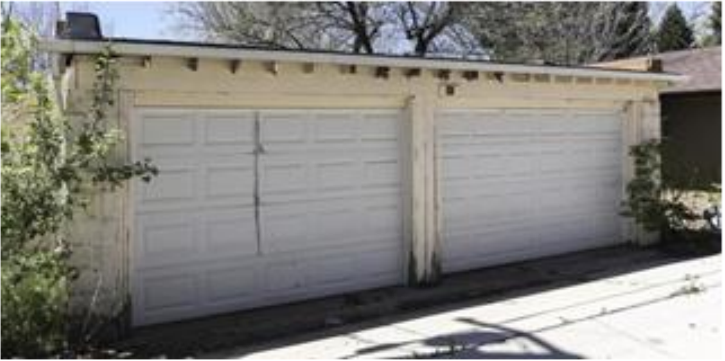
Figure 4: View from Alley of Existing Detached Garage

The property is zoned R-2 Single-Family & Duplex Residential District. Accessory dwelling units are permitted in the R-2 zoning district per Chapter 17.61 – Accessory Dwelling Units of the Castle Rock Municipal Code.