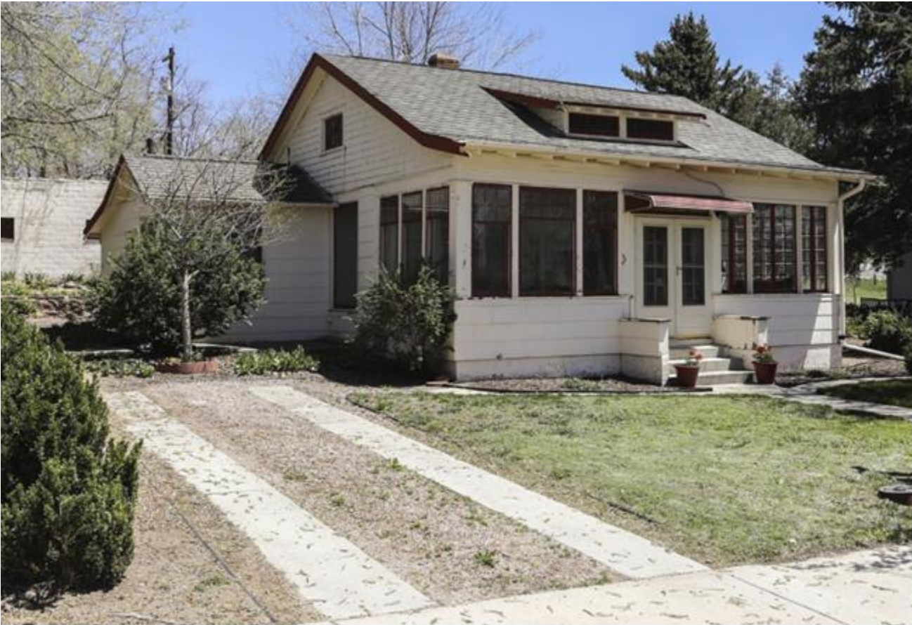
Figure 3: Existing View from North Lewis Street

Platted as part of the Craig & Gould’s Addition to Castle Rock subdivision, the property includes lot 4 and the northern half of lot 5 in block 16. The bungalow/craftsman house is approximately 1,200 square feet and is only one story. The frame home includes clapboard siding, side gabled roof with dormer window, and an enclosed front entry/porch. Built much later than the house, the existing detached garage on the rear of the property adjacent to the alley, is not historic, and is not included as part of the local land marking.