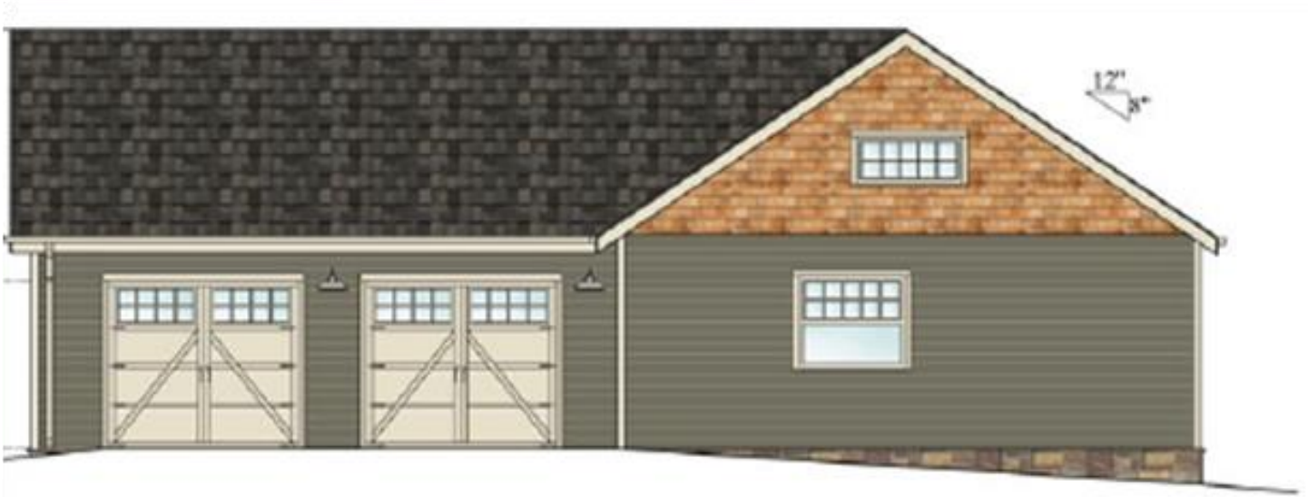
Figure 5: Proposed Garage Elevation, View from Alley

The new one-story detached garage and accessory dwelling unit (ADU) is located in the rear of the property. The new, two-car garage would measure approximately 725 square feet with the accessory dwelling unit measuring 662 square feet.