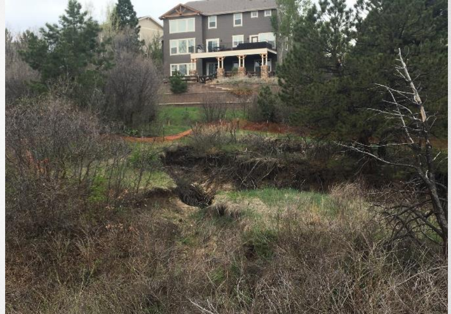
Erosion behind residences on Ridgetrail Drive