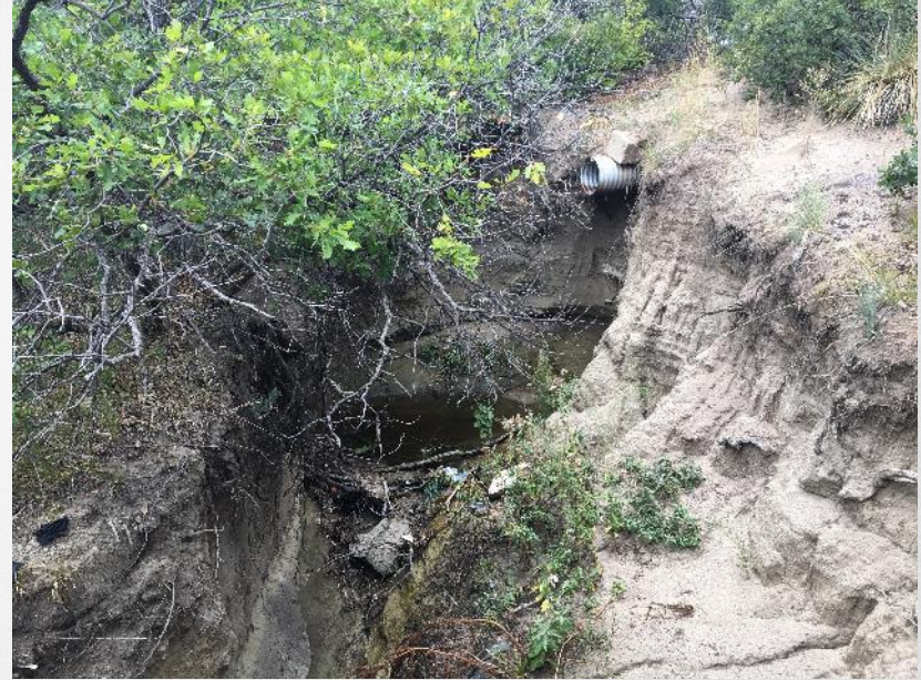
Erosion at Rock Park