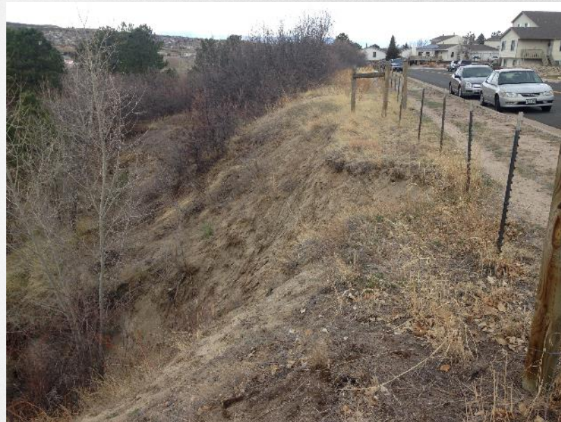
Stream bank adjacent to Canyon Drive