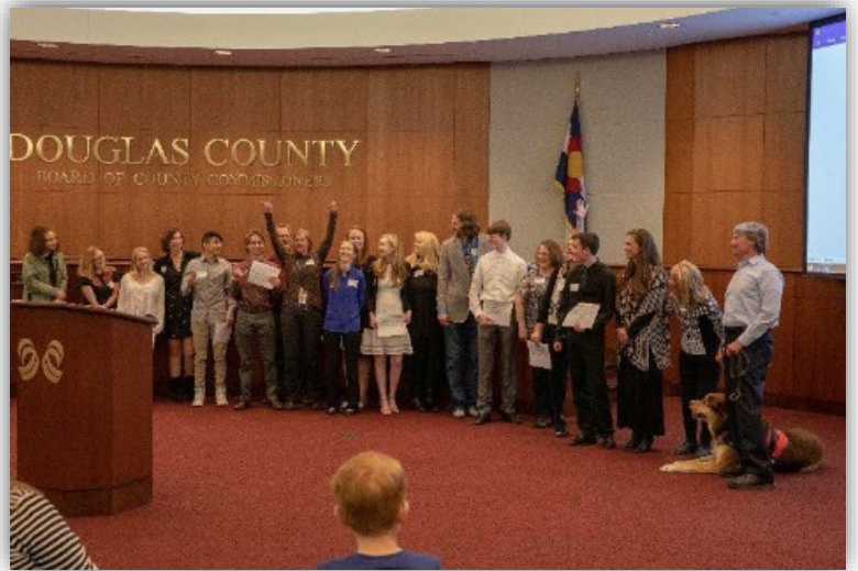
OUTSTANDING YOUTH AWARDS