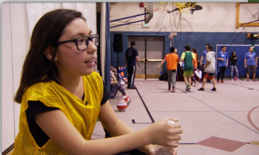
LA LIGA SOCCER AND BASKETBALL