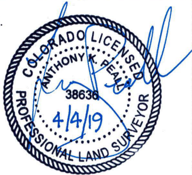
EXHIBIT ATTACHED AND MADE A PART HEREOF.