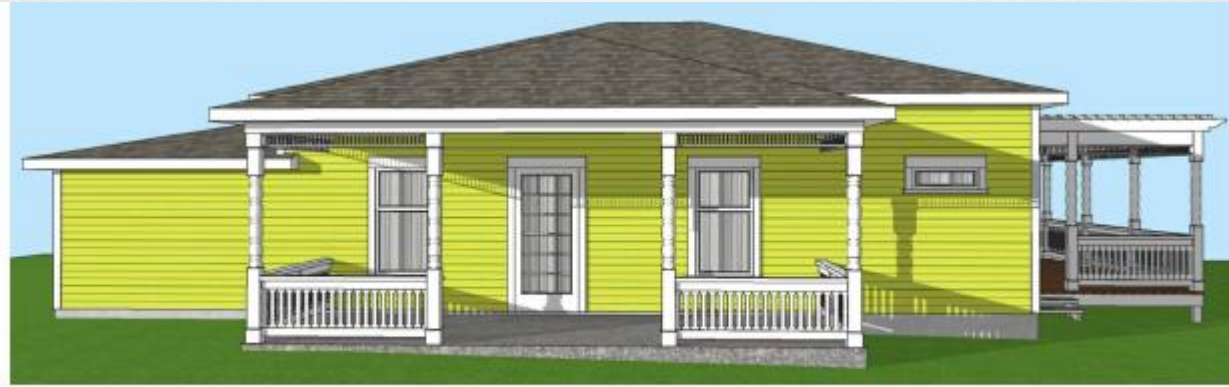
North Elevation Second Street