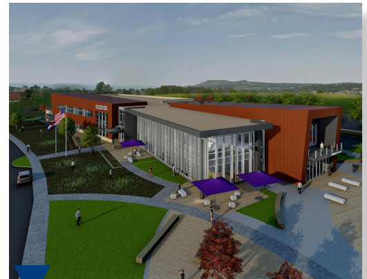
ACC Sturm Collaboration Campus rendering