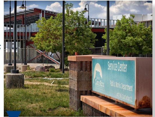
Service Center addition construction