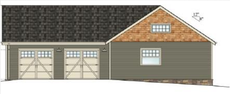
EAST – ALLEY VIEW