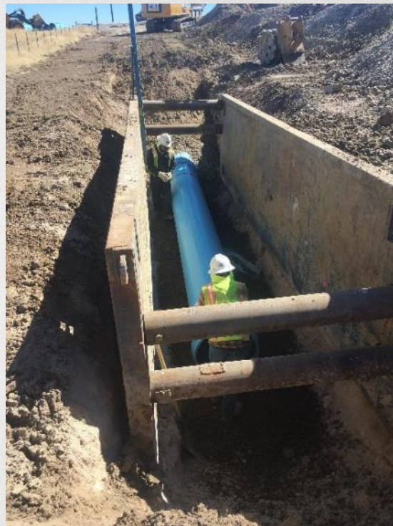
Similar pipeline from WISE project