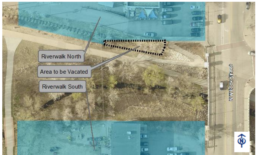
Riverwalk North Portion of Second Street Right-of-Way to be Vacated

Confluence Companies, the owner and developer of Riverwalk, is requesting a vacation of a small portion of Second Street to accommodate the expansion of an outdoor patio along the south property line of Riverwalk North. The Second Street right-of-way on the west side of Wilcox Street does not include street improvements due to the gulch. The Town trail is included within this right-of-way. However, the trail is not located within this proposed vacation area and would remain in Town ownership.