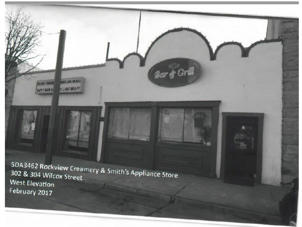
5DA3462 Rockview Creamery & Smith's Appliance Store 302 & 304 Wilcox Street West Elevation February 2017